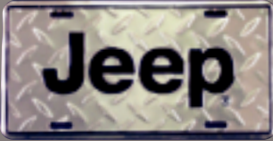
2568 JEEP DIAMOND EMBOSSED

Jeep® is a registered trademark of Chrysler LLC and is used under license. ©Chrysler LLC 2008 49X95