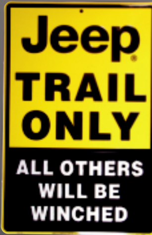
PS30105 JEEP TRAIL ONLY