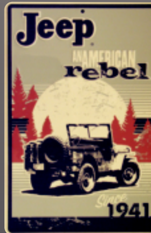
PS30121 JEEP AN AMERICAN