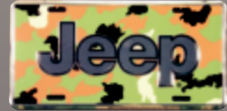
SUP50102 JEEP CAMOUFLAGE