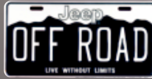
2710 JEEP OFF ROAD