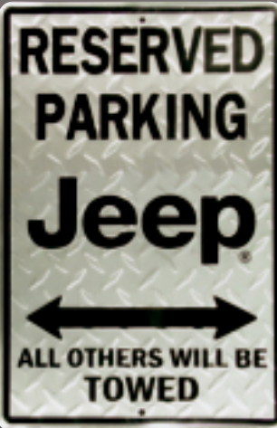
PS30078 RESERVED PARKING-JEEP