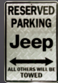
SP80017 RESERVED PARKING JEEP 8X12