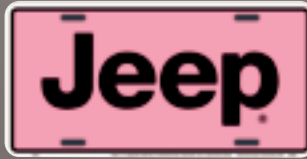
2698 JEEP (PINK)