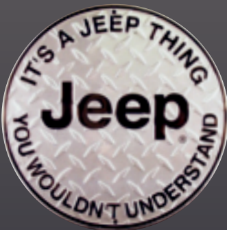
CS60073 JEEP IT'S A JEEP THING...