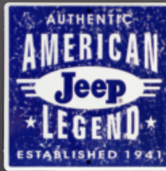
60082 JEEP AMERICAN LEGEND